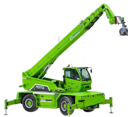
ROTO 50.35 S-PLUS CUTTING EDGE TECHNOLOGY

3800kg maximum load 12.6m maximum lift height Max speed 33m/h