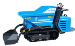
TC95d TRACKED DUMPER