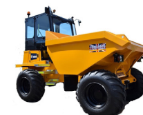
9 TONNE DUMPER WITH CAB

Max safe load 9000kg Unladen weight 4740kg Clearance diameter 14m