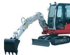
TB230 3 TONNE MINI EXCAVATOR

8 - 10 tonne weight class Max dump height 5260mm Max dig depth 4580mm