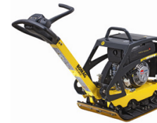
BPR25/40D REVERSIBLE VIBRATORY PLATE

Weight 104kg Performance 3.1kW Working width 450mm