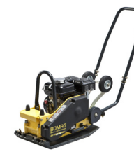
BVP10/36 SINGLE DIRECTION VIBRATORY PLATE COMPACTOR

Weight 65kg Performance 2.6kW Working width 350mm