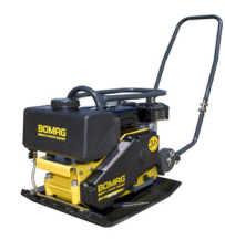
BVP18/45 SINGLE DIRECTION VIBRATORY PLATE COMPACTOR

Weight 83kg Performance 2.6kW Working width 360mm