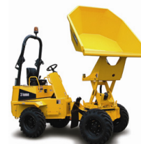
3 TONNE HI SWIVEL MANUAL DUMPER

Max safe load 2000kg Unladen weight 2280kg Load-over height 1781mm