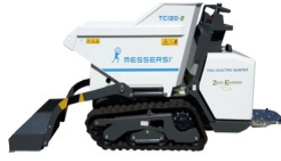
TC120e FULL ELECTRIC TRACKED DUMPER