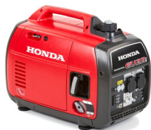
HONDA EU22i PETROL INVERTOR GENERATOR

1800 rated watts 3.6l capacity (Petrol) 21.1kg weight