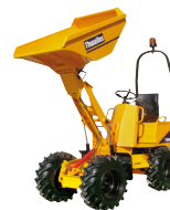
1 TONNE HI TIP HYDROSTATIC DUMPER

Consistently at the forefront of dumper design, Thwaites have answered customers' needs for more than six decades. At every stage of product advancement within the industry, Thwaites have been the innovators.