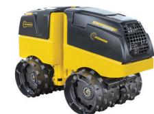
BMP8500 REMOTE CONTROL MULTIPURPOSE ROLLER

Weight 4000kg Performance 33.3kW Working width 1300mm