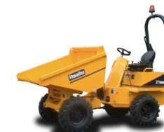
2 TONNE POWERSWIVEL DUMPER

Max safe load 1000kg Unladen weight 1300kg Skip loading height 1256mm