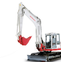
TB2150 15 TONNE WITH OFFSET & BLADE

5 tonne weight class Max dump height 4175mm Max dig depth 3785mm