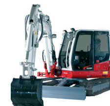
TB260 HIGH SPEC 6 TONNE EXCAVATOR

15 tonne weight class Max dump height 4175mm Max dig depth 3785mm