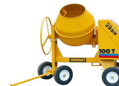
WINGET 100T DIESEL SITE MIXER

25l water tank Petrol, diesel & electric options 450mm floor saw