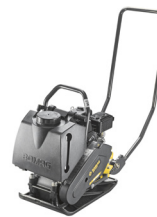
BVP10/35 SINGLE DIRECTION VIBRATORY PLATE COMPACTOR

Technical advice on compaction is also available as well as a variety of compaction aids such as the economiser. As with all Bomag equipment these are easy to use and efficient. Bomag's quality is reflected in their unparalleled re-sale values.