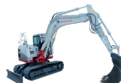
TB290 HIGH SPEC 9 TONNE EXCAVATOR

15.6 tonne weight class Max dump height 7140mm Max dig depth 6060mm