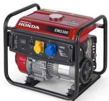
HONDA EM2300 OPEN FRAMED GENERATOR