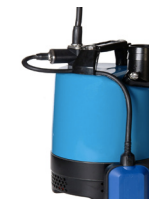
LB800 110v SUBMERSIBLE WATER PUMP

Max capacity 225l/min Bore 50mm Motor output 0.48kW