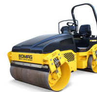
BW120AD-5 TANDEM ROLLER

Weight 1550kg Performance 15.1kW Working width 800mm