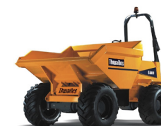
9 TONNE FRONT TIP DUMPER

Max safe load 6000kg Unladen weight 4200kg Clearance diameter 12.6m