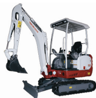
TB216 THE UK'S NO.1 1.5 TONNE MINI

1180kg weight Max dump height 2120mm Max dig depth 1755mm