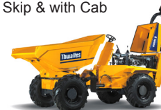
6 TONNE FORWARD TIP DUMPER

Also available in Swivel Skip & with Cab