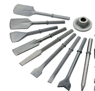
CHISELS AND POINTS

Weight inc. oil 68 kg Power 5.5kW Maximum pressure 150 bar