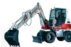
TB295W COMPACT WHEELED EXCAVATOR

3 tonne weight class Max dump height 3230mm Max dig depth 2835mm