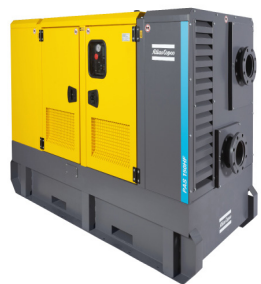
High Performance Dewatering Pumps

Their motto is sustainable productivity. By making breakers and hammers that minimise vibration and noise you are able to work successfully for many years to come. And as you gain experience, your work will improve. That's sustainability at its best.