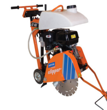
NORTON CLIPPER CS451 FLOOR SAW

Width 620mm Max blade diameter 400mm Max cutting depth 135mm