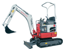
TB210R MICRO EXCAVATOR

1180kg weight Max dump height 2120mm Max dig depth 1755mm