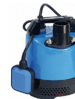
LB480 110v SUBMERSIBLE WATER PUMP

Unmixed capacity 150l Drum speed 22 rev/min Machine weight 395kg