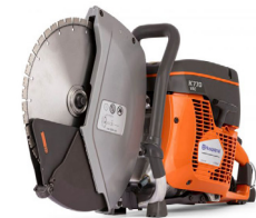
HUSQVARNA K770 350MM CUT OFF SAW

Output 6.0kVA / 4.8kW 24.0l fuel tank (Diesel) 210kg weight