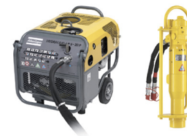
LP 9-20 E HYDRAULIC POWER PACK

Quiet operation User friendly Highly efficient