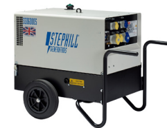
STEPHILL SSD6000S SILENCED YAMMAR GENERATOR

Output 3.4kVA / 2.7kW 3.1l fuel tank (Petrol) 42kg weight