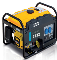
ATLAS COPCO P3000 PORTABLE GENERATOR

1800 rated watts 3.6l capacity (Petrol) 21.1kg weight