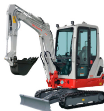
TB225 COMPACT EXCAVATOR

1.5 tonne weight class Max dump height 2705mm Max dig depth 2390mm