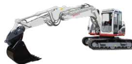
TB2150R MONO BOOM Available with two piece boom and blade

2.5 tonne weight class Max dump height 2875mm Max dig depth 2580mm