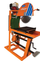
NORTON CLIPPER CM501 PETROL BENCH SAW

Cylinder displacement 73.5cm 3 Blade diameter 350mm Output power 3.7kW