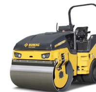
BW 135 AD-5 ASPHALT ROLLER

Weight 2750kg Performance 24.6kW Working width 1200mm