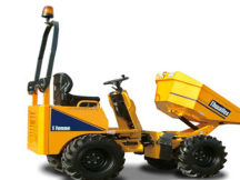
1 TONNE POWERSWIVEL DUMPER

Max safe load 1000kg Unladen weight 1295kg Load-over height 1913mm