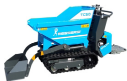
TC50 MINI DUMPER