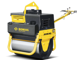
BW71E HEAVY DUTY SINGLE DRUM ROLLER

Weight 140kg Performance 3.6kW Working width 500mm