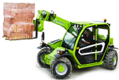
P27.6 ULTRA COMPACT TELEHANDLER

2.7 tonne lifting capacity 6.1m boom height Max speed 40km/h