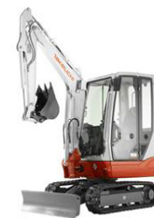
TB250 POWERFUL 5 TONNE MIDI EXCAVATOR

10 tonne weight class Max dump height 6480mm Max dig depth 4115mm