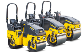
BW80 AD-5 LIGHT TANDEM ROLLER

Weight 488kg Performance 6.8kW Working width 710mm