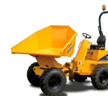
3 TONNE POWERSWIVEL MANUAL DUMPER

Max safe load 3000kg Unladen weight 2790kg Load over height 2000mm