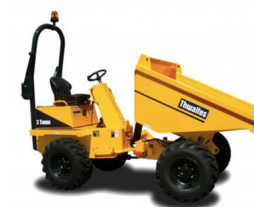
3 TONNE FRONT TIP MANUAL OR HYDROSTATIC

Max safe load 3000kg Unladen weight 2160kg Skip loading height 1565mm