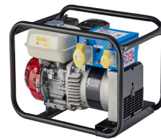
STEPHILL 3400HM OPEN FRAMED GENERATOR

AVR electric start 11 hours before refuelling 52kg weight