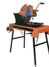
NORTON CLIPPER TILE SAW CM42

Supply voltage 4.8kW Cutting depth 195mm 165kg weight Also available in 110v